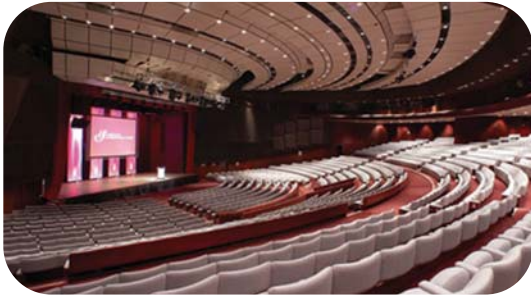
The Harrogate Auditorium